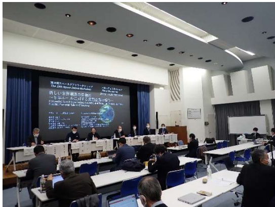
10th Workshop @JAXA Chofu Aerospace Center (Tokyo, Japan)